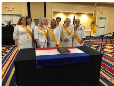
Nine of our Past National Presidents attended.